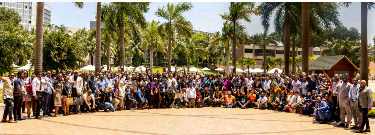
Photo: AfPIF 2023, Accra Ghana